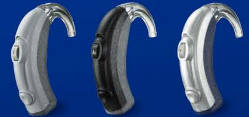
Light Grey/Dark Grey Black/Dark Grey Silver/Blue