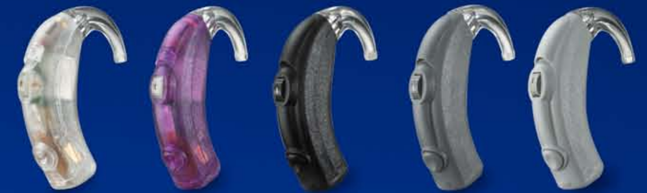
Ice Ice Purple Black Dark Grey Light Grey

PsP’s streamlined, channel-back design offers more than just good looks. A unique suspended receiver system also works as a double shock absorber to provide more high-powered, usable gain. Exciting colors, including two-tone combinations, and optional open-fit and ELI DirX™ wireless accessories, provide patients with an extremely flexible BTE without compromising performance or aesthetics.