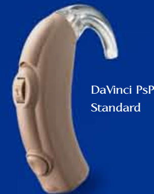
DaVinci PsP Standard

PsP is the latest addition to Starkey’s DaVinci family of digital, behind-the-ear instruments. An innovative hybrid design provides the flexibility for standard, super-power fittings or is easily convertible to an instant-fit, open-ear instrument. PsP’s unique design attributes are accomplished through the merging of mechanical design excellence with advanced product features. We invite you to discover a new level of flexibility, performance and design with DaVinci PsP.