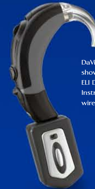
DaVinci PsP Standard shown with the optional ELI DirX (Ear Level Instrument) Bluetooth® wireless system.

Imaging™ (PDI) system in the majority of all listening situations – a significant breakthrough, because PDI preserves low-frequency gain and minimizes microphone noise while in the directional mode.