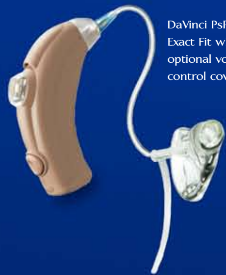
DaVinci PsP Exact Fit with optional volume control cover