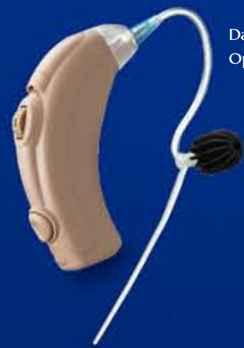
DaVinci PsP Open