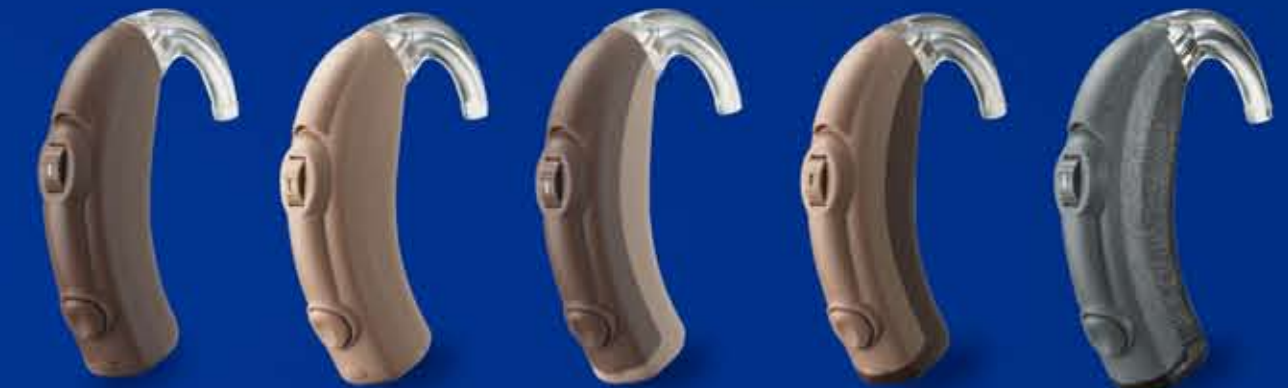
Dark Brown Beige Dark Brown/Beige Beige/Dark Brown Dark Grey/Black