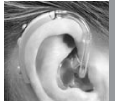
PDI BTE from Starkey Labs

With fewer sounds competing for your attention, understanding in noisy places can be significantly improved, especially compared to hearing instruments without this directional capability.