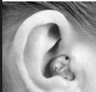
PDI ITC from Starkey Labs

...reduces interference of sounds and conversations from the sides and rear.