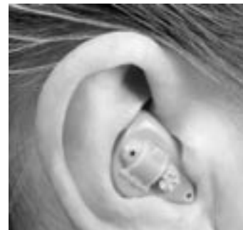
PDI ITE from Starkey Labs